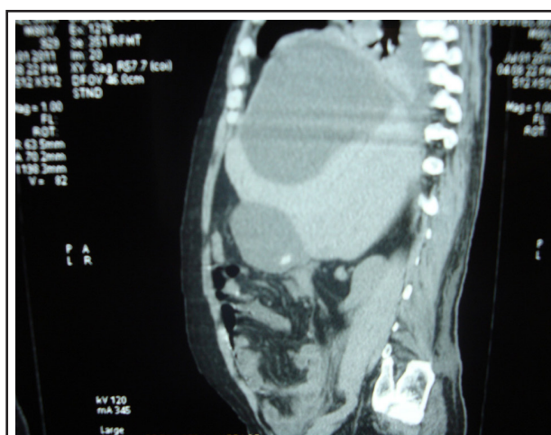
Figure 2. A sagittal image on CT scan revealing subcapsular collection along superior surface of liver (A small gall stone evident along with).

Subcapsular bilioma is a rare entity. As with any other intrahepatic biliomas it occurs secondarily to surgical procedures involving biliary tract or trauma. However, there are a number of case reports on spontaneous subcapsular bilioma without antecedent history of surgery, invasive procedures in liver and biliary tract or trauma. 9 Spontaneous biliomas occur in setting of underlying biliary pathology, mainly biliary obstruction due to choledo-cholithiasis, 5 cholangiocarcinoma, 3 pancreatic cancer. 6 Spontaneous idiopathic subcapsular bilioma is an extremely uncommon condition and to our knowledge there has been only a single case report so far. 7 Our case is one of such spontaneous subcapsular bilioma without any identifiable biliary obstruction or calculi. Occurrence of a solitary calculus in gallbladder is an issue that created confusion. Possibility that a stone in common duct could have incited the whole event which in turn passed away spontaneously could not be ruled out. However normal biliary channels imaged in MRCP and apparently normal papilla at endoscopy underscores that gall bladder calculus could just be an incidental finding. Hence we propose it to be spontaneous idiopathic subcapsular bilioma of liver.