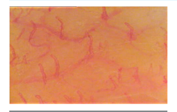
Figure 3. Oral microcirculation of healthy subject. (magnification 200X)