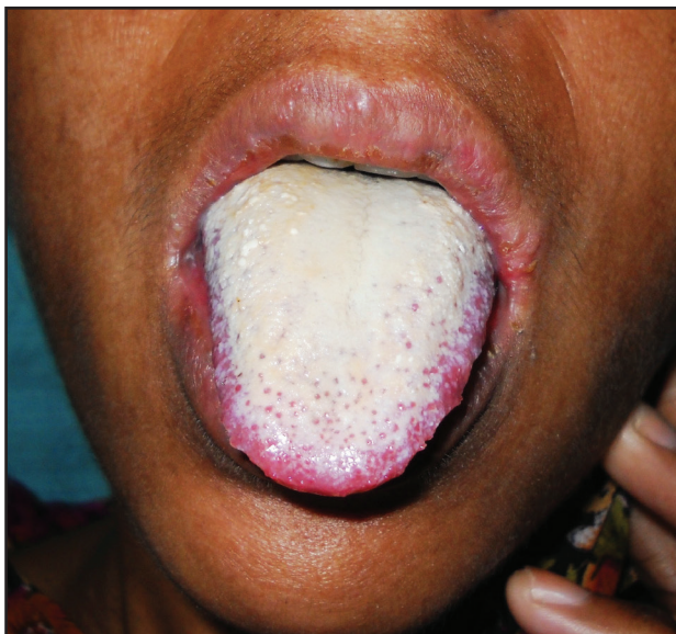
Figure 1. This 27-year-old woman presented with extensive oral candidiasis involving her tongue giving it a coated appearance. There is also angular cheilitis on the left side.

diagnosis of oral candidiasis of pseudomembranous type was made. There was also evidence of angular cheilitis on the left side. It was learnt that the patient used corticosteroid inhaler for her asthma since the last seven-to-eight years. She also suffered from upper respiratory tract infection and fever about seven days back. Her general condition was otherwise within normal limits; she was afebrile, non-diabetic, had no history of significant weight loss in the last six months with no history of high-risk behaviour. Human Immunodeficiency Virus (HIV)-1 and 2 antigens were non-reactive. Commercially available topical clotrimazole preparation as oral mucosal paint in one percent weight/volume strength was advised to her, apart from multivitamin supplements and instructions to maintain proper oral hygiene.