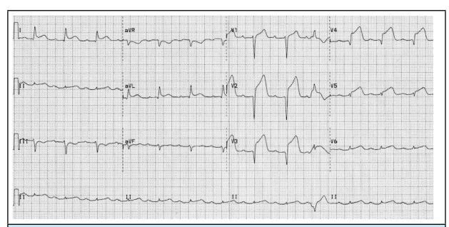
Figure 2. Electrocardiogram during the episode of chest pain.

After 40 hours of admission, she again complained of retrosternal chest pain, a severe tearing type associated with sweating and nausea. The pain lasted for 30 minutes. ECG performed revealed significant ST elevation in leads V1, V2, V3, V4, and ST depression in leads II, III, and aVF (Figure 2). Screening echocardiography showed hypokinetic left anterior descending artery territory, mild mitral regurgitation, and left ventricular ejection fraction (LVEF) of 40%. Coronary angiography performed stat revealed significant occlusion in the ostial left anterior descending (LAD) artery while the right system was normal (Figure 3).