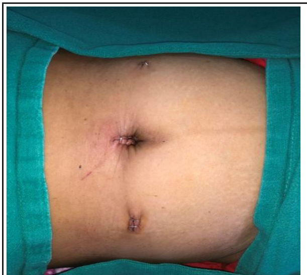
Figure 3. Showing laparoscopic ports position.

She was admitted and planned for laparoscopic repair under general anaesthesia. After pre-operative evaluation, she was managed with transabdominal preperitoneal (TAPP) repair. Initially, a diagnostic laparoscopy was done and hernia repair was approached transabdominal. A supraumbilical port incision was made and a pneumoperitoneum was created (Figure 3).