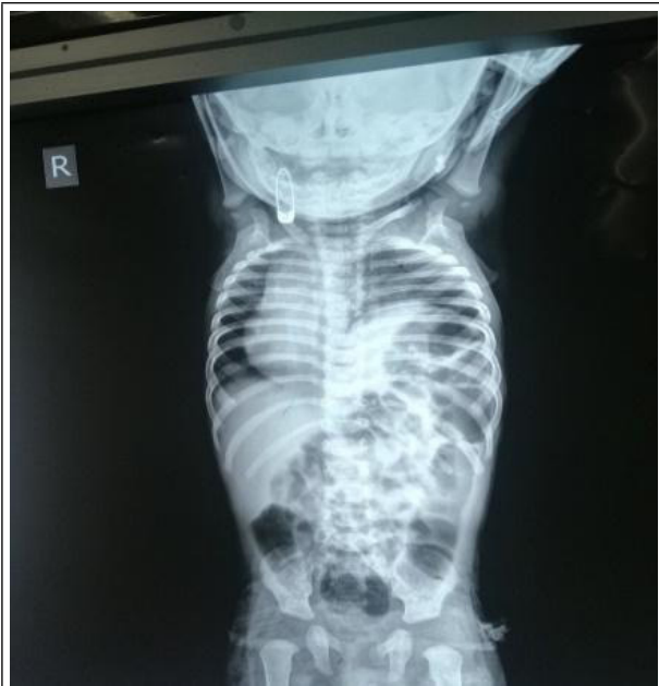
Figure 1. Chest X-ray showing elevated dome of left hemidiaphragm with cardiac silhouette towards the right side.

Echocardiography was done which revealed dextrocardia with no significant structural abnormalities. The patient was treated in coordination with the medical team for pneumonia. Once patient was maintaining oxygen saturation in room air, surgery was planned; plication of the diaphragm was done through the trans-abdominal approach (Figure 2). Intraoperatively the chest tube was kept in situ. The patient was kept in the Surgical Intensive Care Unit for two days. Post-operative chest x-ray showed a small pneumothorax on the left side with a chest tube in situ (Figure 3). Pneumothorax was resolved by the 2 nd postoperative day, then the chest tube was removed. The patient was then shifted to the surgical ward and oral feeding was started. Alternate-day dressing was done and parenteral antibiotics were continued for a total of seven days. Patient's chest retraction subsided and he was maintaining oxygen saturation in room air, he was then discharged on the 7 th postoperative day.