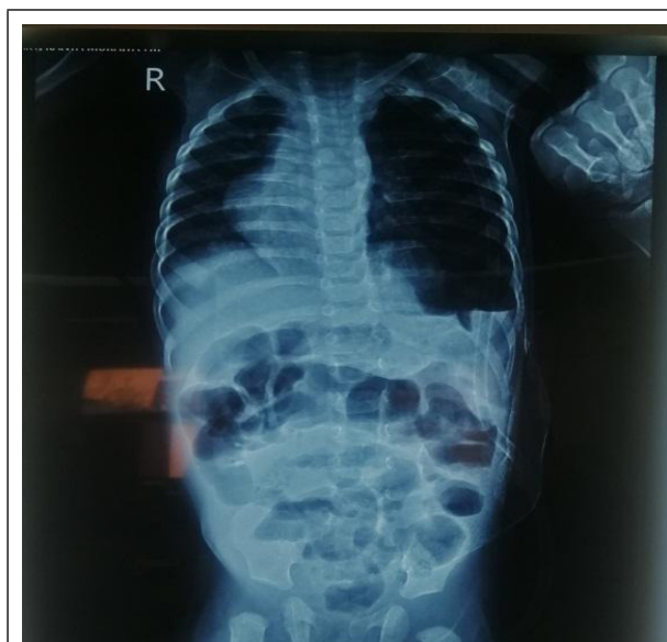
Figure 3. Post-operative chest X-ray showing lowered left hemidiaphragm with chest tube in-situ on the left side.